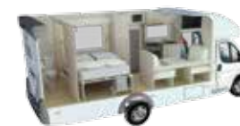
Walls & Roof On