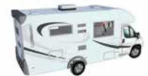
Quality Assurance Testing